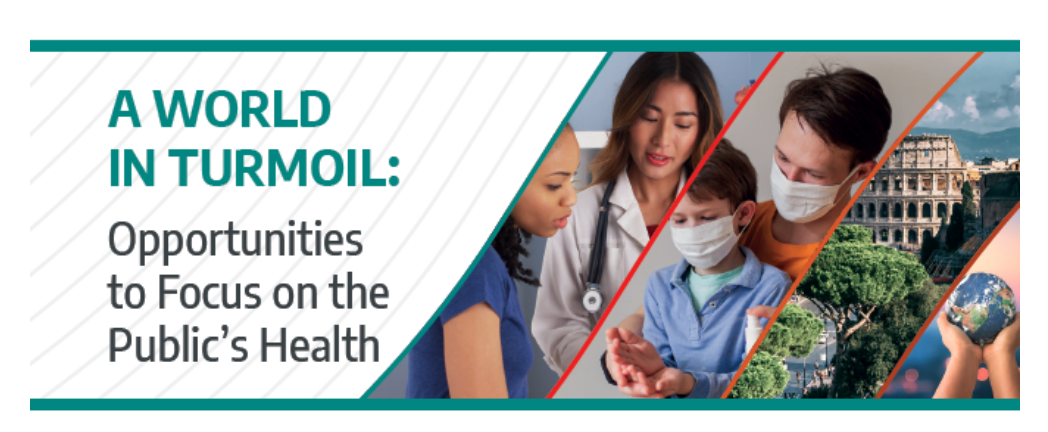
Jointly organised by