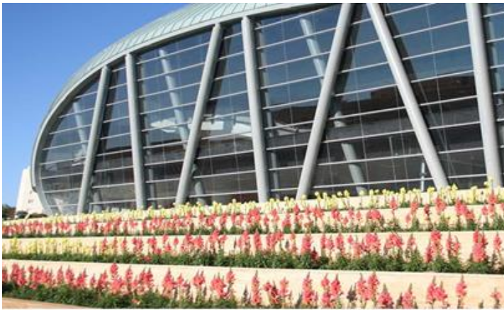
The International Convention Center at AAC