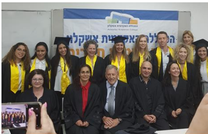
AAC Public Health Program: First graduating class with core faculty members