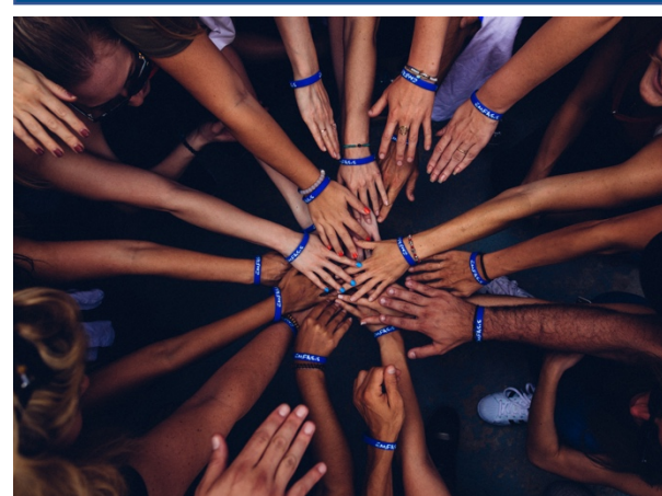
Strengthen your professional identity, skills and confidence together with ambitious colleagues!

Strengthening the public health workforce is probably the biggest public health challenge of the next decade