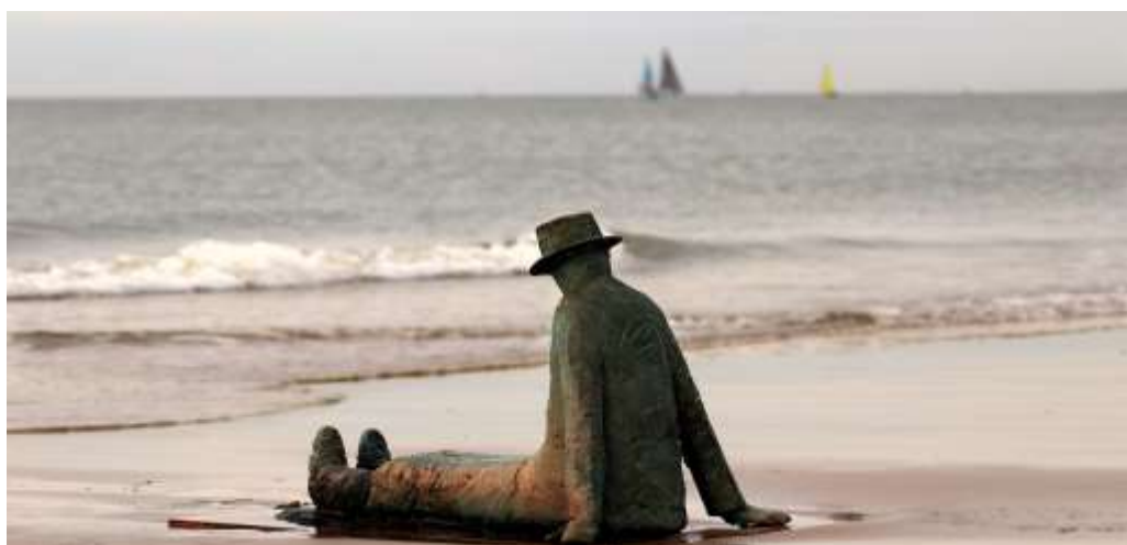
Pictured: Jean-Michel Folon Sculpture, Knokke, Belgium