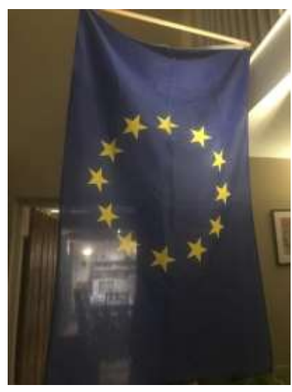
The EU flag flying high in the Middleton household on 31<sup>st</sup> January 2020 – a sad day for all Europeans. But we will continue to fight for the European idea. If you will have us, we will be back!

ASPHER will continue to argue for the re-establishment of effective public health systems, for the control of communicable disease; pandemics are the most extreme concern, but not the daily concern. We greatly value our partnerships with WHO, ECDC, and other national and international bodies working tirelessly on coronavirus at present, and particularly in our work developing capacity and training. The public health community, however, appears to be uninvolved in the new disaster of the desert locust plague. This now affecting East Africa, the Horn of Africa, extending through Yemen and as far as Pakistan. It is undoubtedly linked to global climate breakdown. A new wave of the plague is anticipated in April and our responses have been weak. I shall be pleased to hear from anyone connected with the problem- directly as public health agencies or working with the UN Food and Agriculture Organization trying to tackle the red horse, Famine, later in the year.