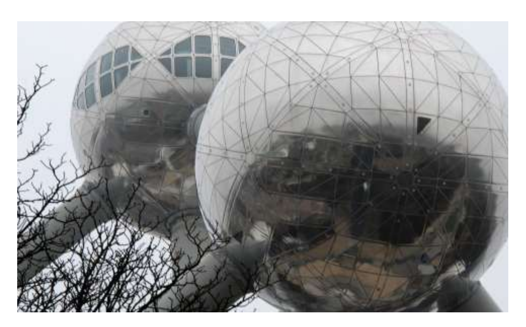
Pictured: Atomium, Brussels – image by Evelyn de Bruin from Pixabay