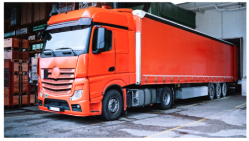
Industry figures, and some drivers, have been warning of a lorry driver shortage for years

Shoppers face low stock, long delivery times and price rises as retailers across the country battle to secure drivers for the Christmas period