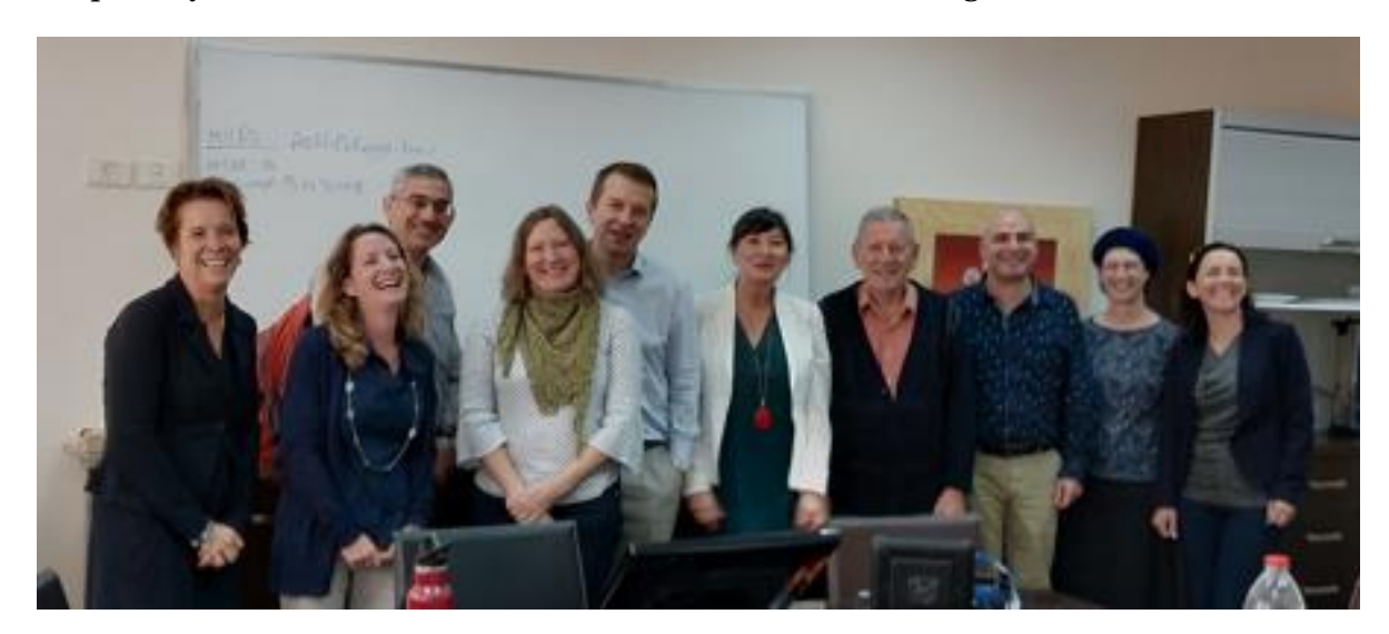
Opportunities for further exchange between EU and Israeli SPHs were discussed and a delegation from AAC is expected to come to Maastricht in September 2019.

visited south Tel Aviv where many migrants live. They toured a maternal and child health clinic and a primary health care clinic, which caters to undocumented migrants.