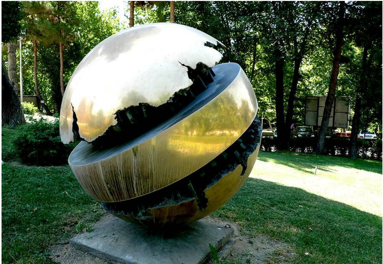
Image: Sphere within a Sphere ( Sfera con sfera ) by sculptor Arnaldo Pomodoro at Tehran Museum of Contemporary Art