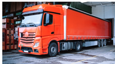
Industry figures, and some drivers, have been warning of a lorry driver shortage for years

Shoppers face low stock, long delivery times and price rises as retailers across the country battle to secure drivers for the Christmas period