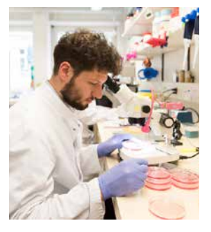
Doctoral and PhD Programmes